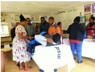
Training on how to use the lifewraps

It took many days of training to involve all healthcare workers of all locations. Thanks to the donation from Ifakara of the NASG's, financial assistance of Zonta and various private donors through MamboSteunPunt we made it.